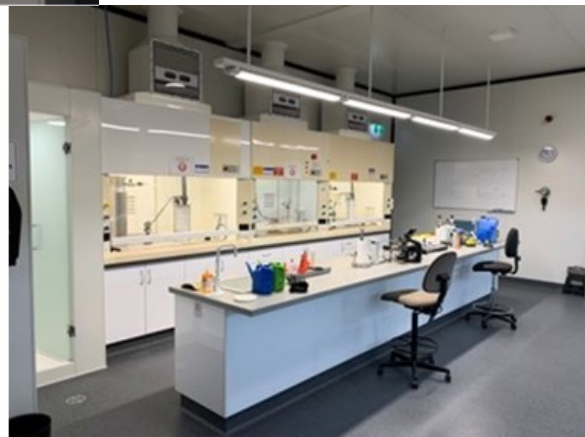
Figure 5: Alcore test lab, fume cabinets with hi-tech scrubbers, showers, microscopes & Drager air monitor (wall)