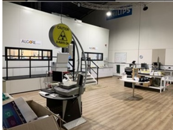
Figure 4: Preparation & Analytical Lab, XRF & furnaces

The Core Lab is a climate-controlled laboratory constructed inside the Alcore Research Centre to produce test samples of AlF_3 and co-products. It will become a research centre for testing the technology on many ores.