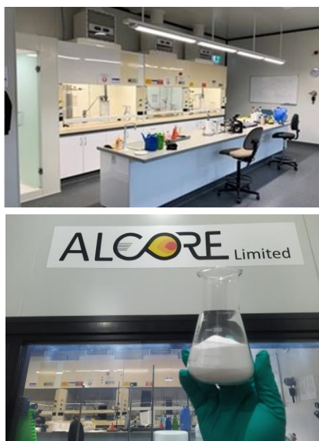
Figure 4 (above): AlF_3 product produced in Alcore laboratory.

The lab has preparation equipment, 3 large fume cabinets, high-technology fume scrubbers, driers and furnaces, showers, microscopes & Draegar air monitor (far wall)