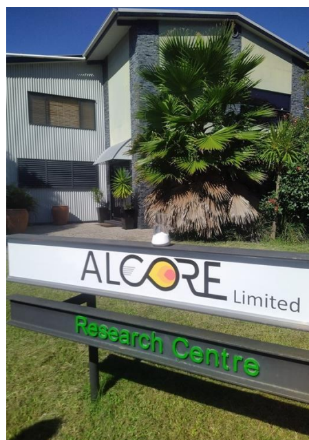
Figure 2: the $2.5m Alcore Research Centre