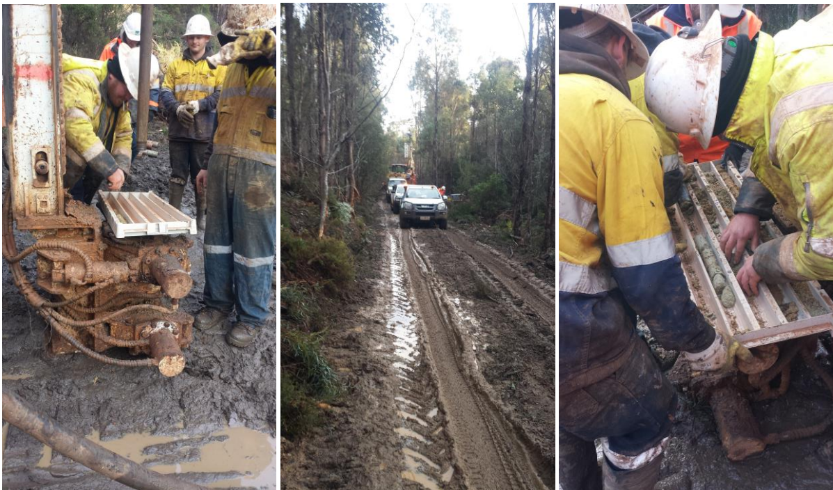
Figures 5 to 7: Push-tube core drilling was developed to overcome difficult conditions that affected some areas