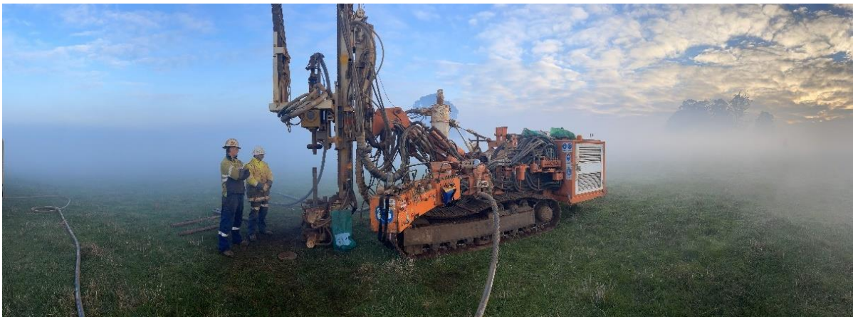
Figure 4: Sunrise at a Deep Leads drill site, northern Tasmania