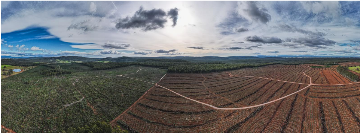
Figure 3: Deep Leads REE project on recently cleared hardwood plantations