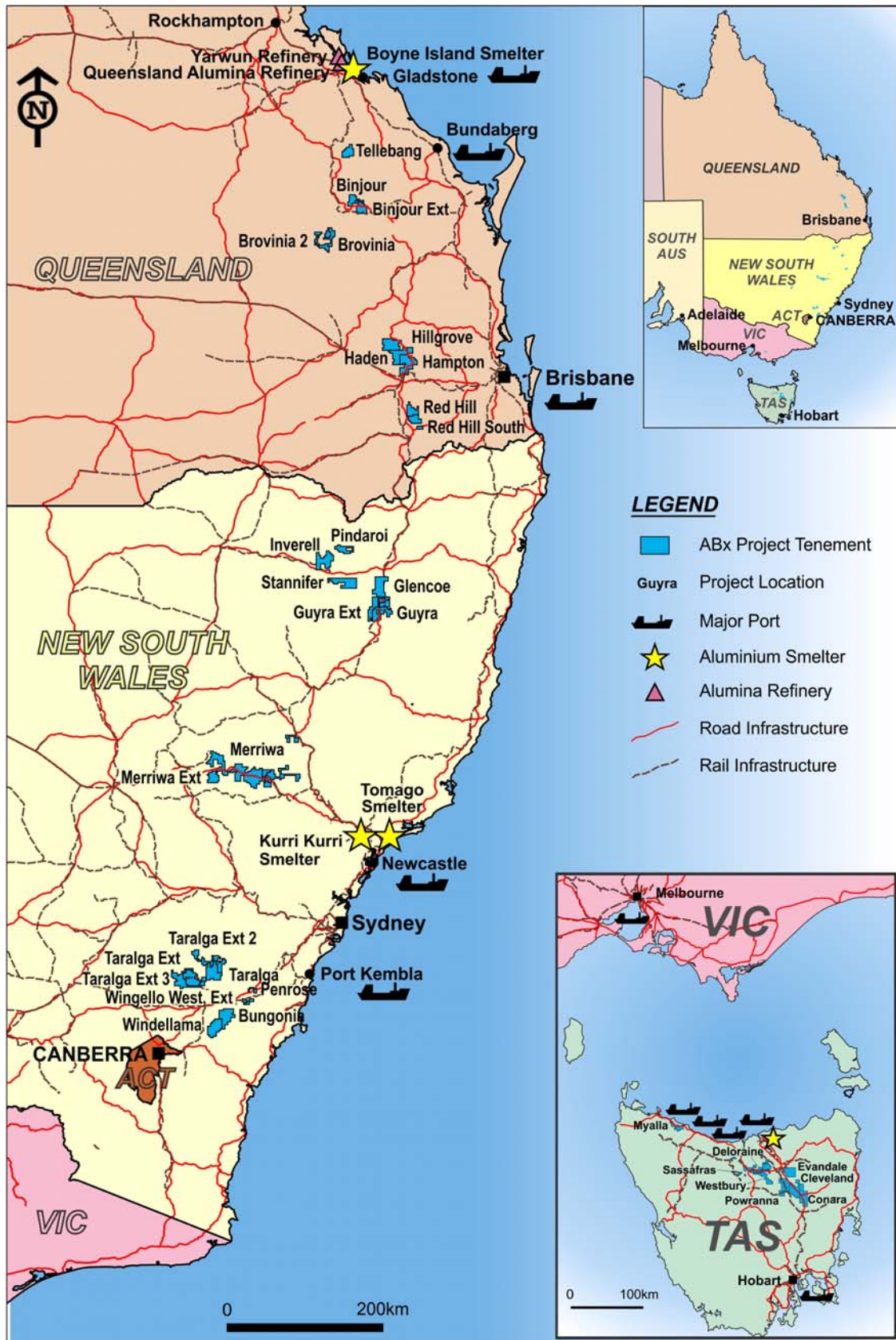
Figure 3: ABx Project Tenements and Major Infrastructure