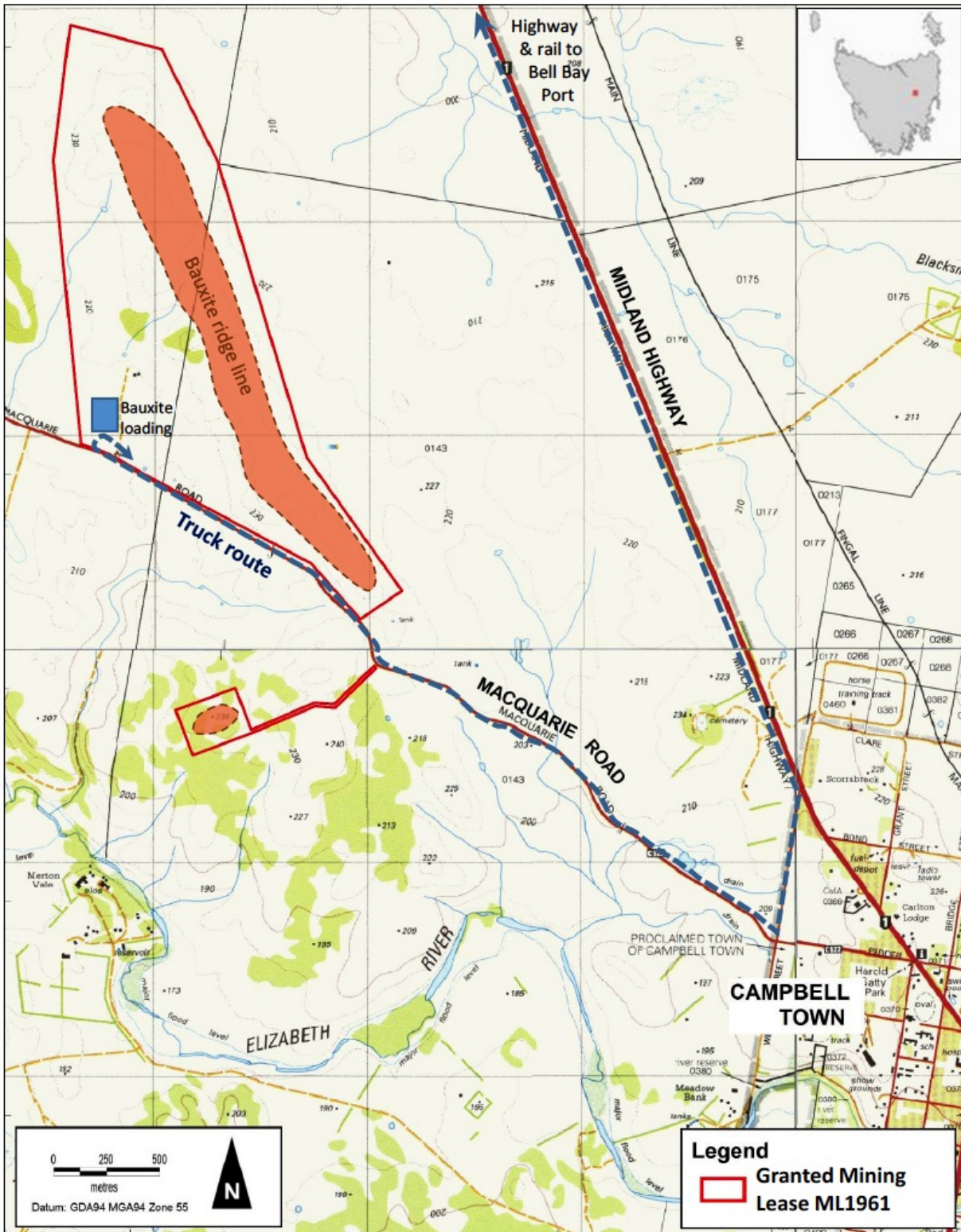
Figure 2: Bald Hill Mining Lease ML1961, Campbell Town, Tasmania